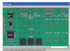
Ersas Autoprofiler: Easy offline profiling for highest machine uptimes.