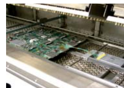
Integrated Bluetooth wireless module, Data transmission and display in real-time.